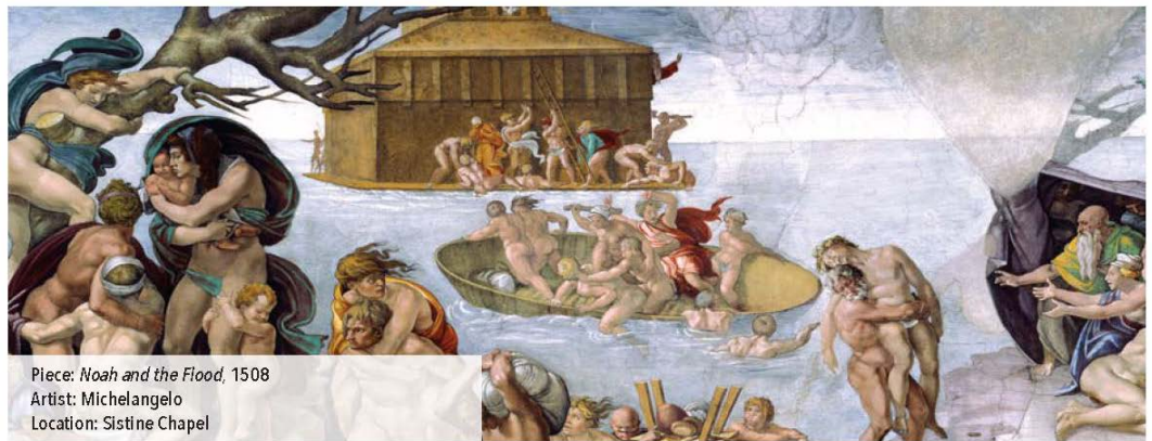
Piece: Noah and the Flood, 1508 Artist: Michelangelo Location: Sistine Chapel

What important lessons have I learned from a challenge in my life? Maybe I can share that lesson with a friend or family member.